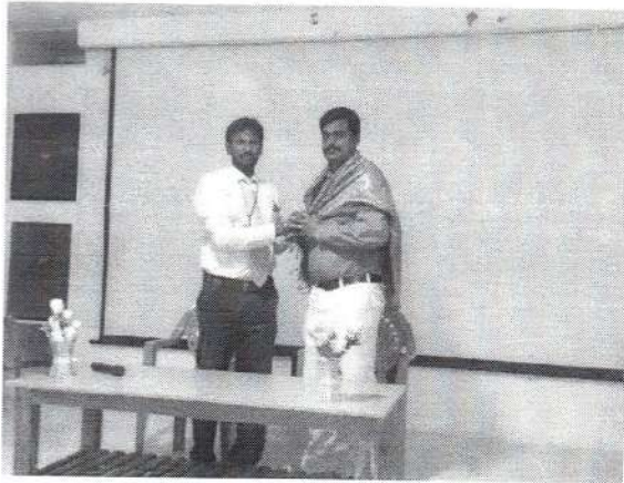
Honoring the Resource Person